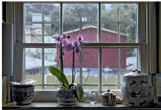
"Orchids in the Window"