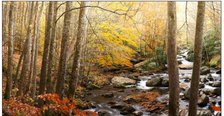
"A Fall Forest"