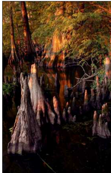
"Boggy Knees" Jimmy Knight - 26 Points