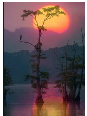
"Sunrise Fantasy" Tom Furlotte - 25 Points