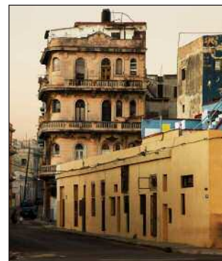
"Edificio Yogi "