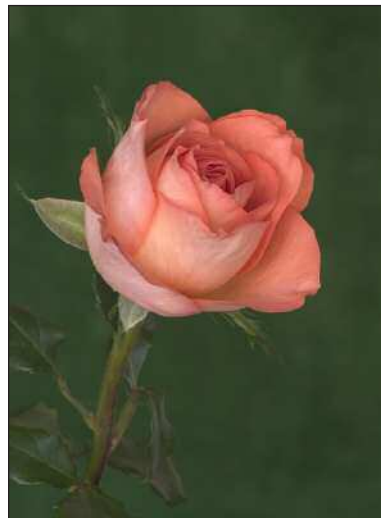
"A pink Rose"